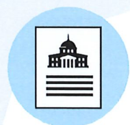
Other Government Document