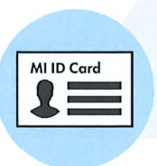
State ID Card