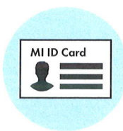
State ID Card