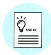
Current Utility Bill