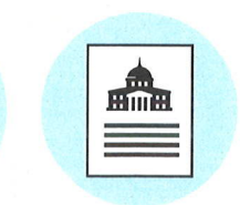
Other Government Document